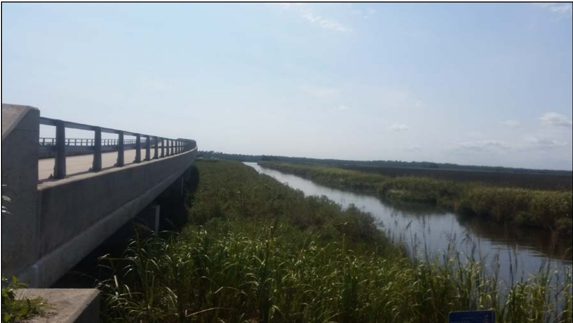
Photo 2- View into northern portion of site.